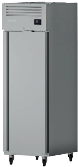
AGB 23 TOP MOUNTED REACH-IN

A superior energy efficient refrigeration system built with AISI stainless steel interiors and exteriors, universal tray slides, and digital temperature controllers.