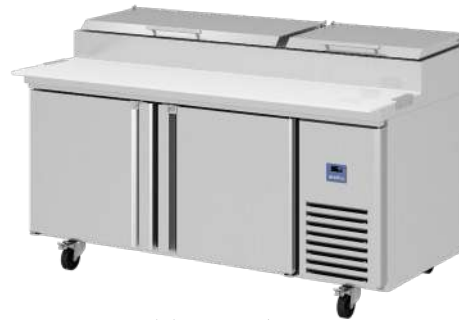
MR 67 EN 67 INCH PIZZA PREP TABLE