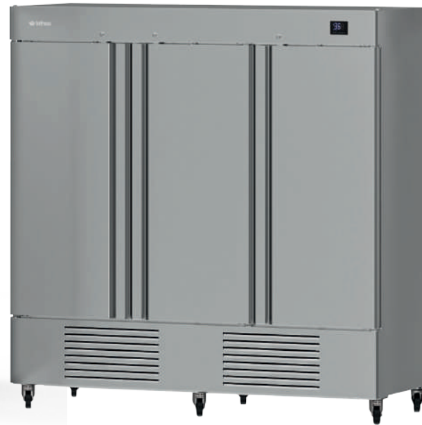
AN 67 3 DOOR BOTTOM MOUNTED REACH-IN