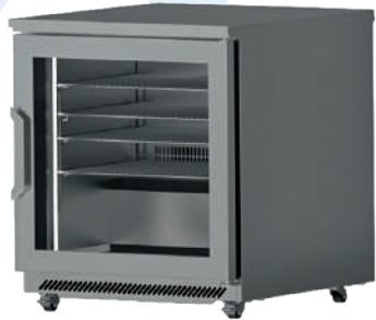
UC 27R CR 27 INCH UNDERCOUNTER GLASS DOOR

A wide range of sizes with standard stainless steel interiors and exteriors, offering an innovative design with unparalleled performance.