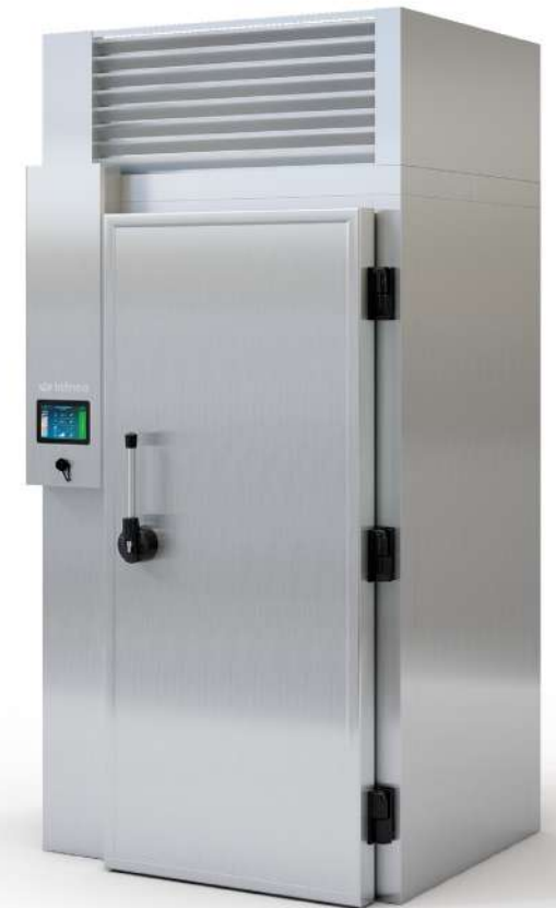
IBC-ABT 20 1CB1 ROLL IN BLAST CHILLER