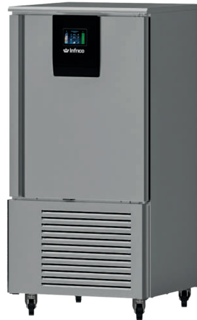
ABT 10/14 10 & 14 PAN BLASTCHILLER