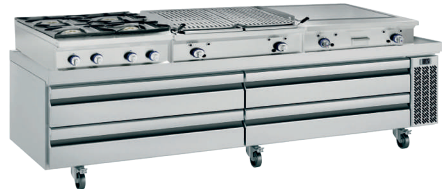
MSG 96 96 INCH CHEF BASE