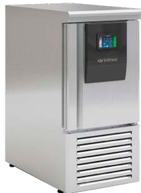
ABT 61C 6 PAN BLAST CHILLER