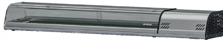
VSU 77R 77" SUSHI DISPLAY CASE RIGHT MOUNTED