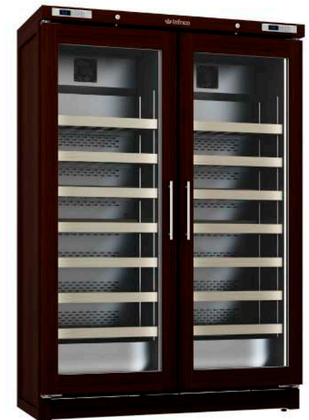
EVV 200MX RETRO REFRIGERATOR WOOD FINISH