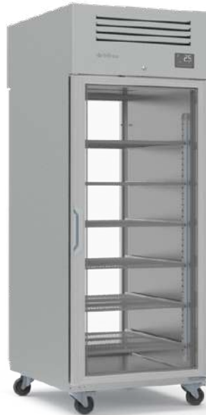
AGB 901 PDCR PASS THROUGH REACH-IN