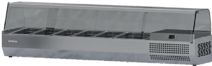
VIP 1740B 1/3 GLASSTOP INGREDIENT DISPLAY CASE GLASS TOP