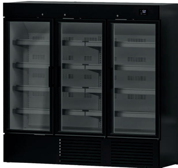
ERC 200PH 3-DOOR MERCHANDISER FREEZER