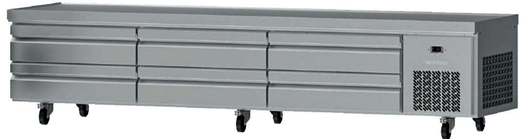
MSG 110 110 INCH CHEF BASE