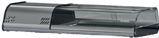
VSU 50L 50" SUSHI DISPLAY CASE LEFT MOUNTED

Sushi and ingredient display cases made to maintain optimal food temperature.