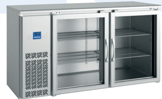
ERV 60 GD 2-GLASS DOOR BACKBAR COOLER