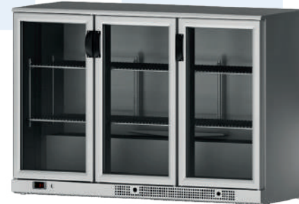
ERV 35 II GD 3-GLASS DOOR SHALLOW BACKBAR COOLER