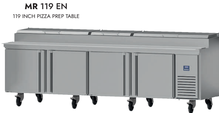
MR 119 EN 119 INCH PIZZA PREP TABLE