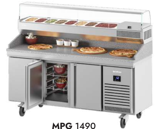
MPG 1490 "GRANITE TOP PIZZA PREP TABLE"