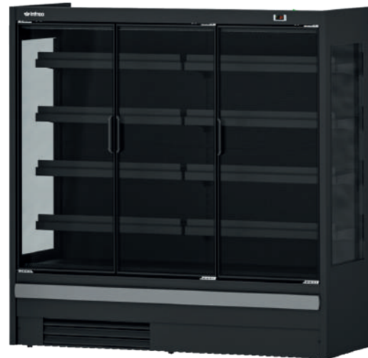
ML 18DC C VERTICAL GLASS DOOR MERCHANDISER