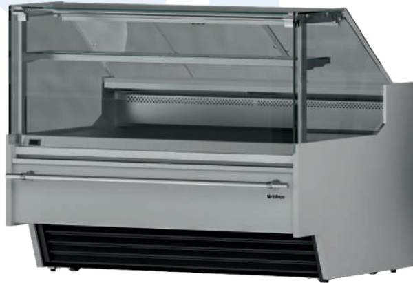
VBC 12 SCP MEAT/DELI CASE STRAIGHT GLASS

European design with eye-catching features that adhere to industry standards and practicality.