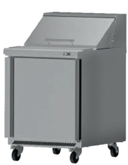
UC 27P 27 INCH SANDWICH PREP TABLE

Sandwich and pizza prep tables of all footprints that are specifically designed with food safety in mind.