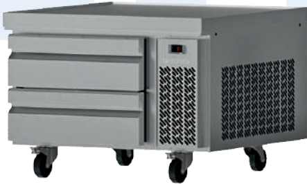
MSG 36 36 INCH CHEF BASE

Heavy-duty and built to withstand dense equipment while minimizing heat transfer.