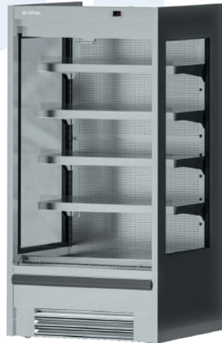
ML9 I VERTICAL OPEN MERCHANDISER STAINLESS STEEL