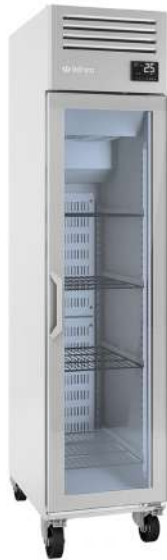
AGN 300 CR SLIMLINE GLASS DOOR REACH-IN