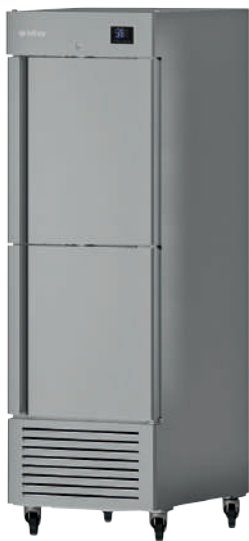
AN 23_2 BOTTOM MOUNTED REACH-IN SPLIT DOORS