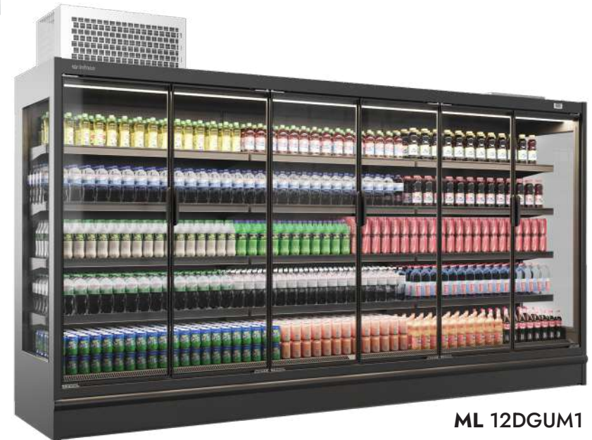
ML 12DGUM1 SUPERMARKET GLASS DOOR MERCHANDISER SELF-CONTAINED