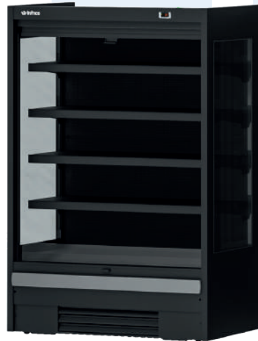
ML 12 C VERTICAL OPEN MERCHANDISER PAINTED STEEL