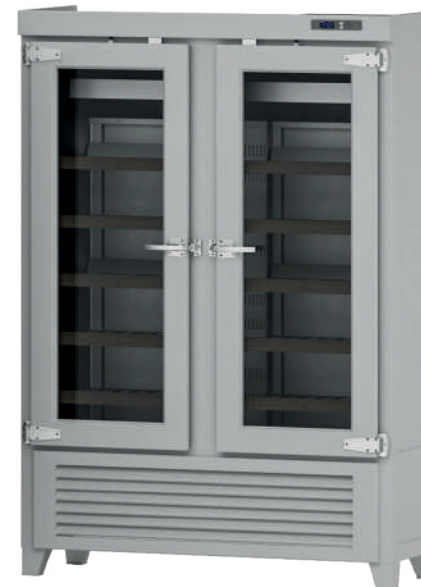
EVV 49 R2G DUAL TEMP WINE COOLER PINE WOOD FINISH