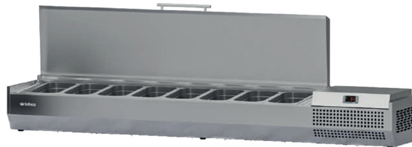
VIP 1980B 1/3 SOLID LID INGREDIENT DISPLAY CASE SOLID TOP