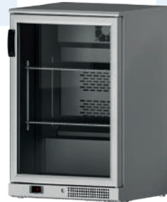
ERV 15 II GD GLASS DOOR SHALLOW BACKBAR COOLER