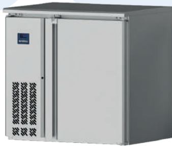
ERV 36 II SD SOLID DOOR BACKBAR COOLER

Wide and narrow options with a one-of-a-kind design for beverage and food storage.