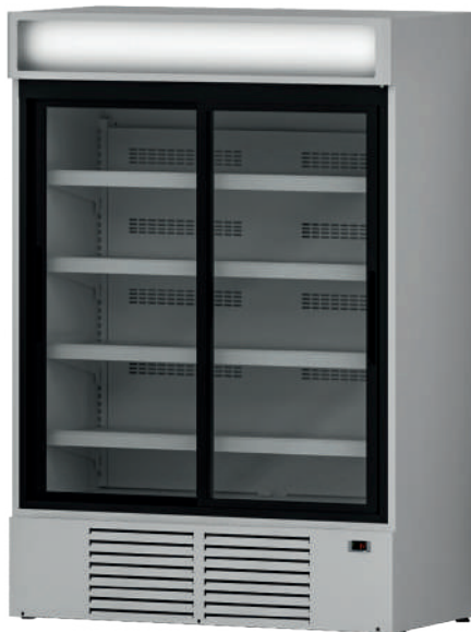
ERC 130 SLIDING DOOR BEVERAGE MERCHANDISER