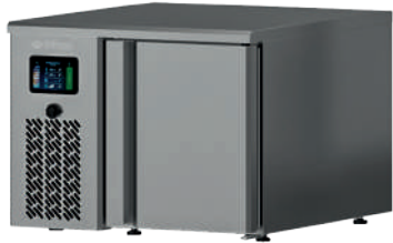
AB T3 3 PAN BLAST CHILLER

HACCP compliant, with basic blast chill and shock freeze functions, and an easy-to-use programmable interface.