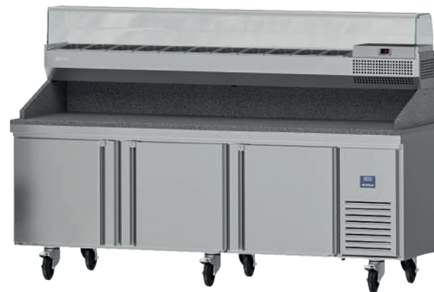
MR 93GT COMBO 93 INCH GRANITE TOP PIZZA PREP TABLE