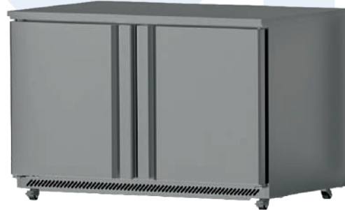
UC 48R 48 INCH 2-DOOR UNDERCOUNTER