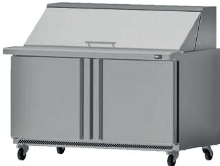
UC 48PMT 48 INCH MEGATOP SANDWICH PREP TABLE