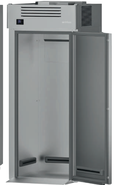
AGB 45 RI ROLL IN REFRIGERATOR