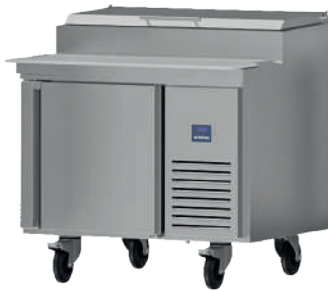
MR 41 EN 41 INCH PIZZA PREP TABLE