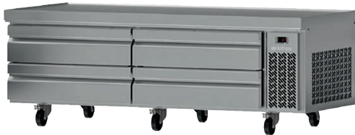
MSG 72 72 INCH CHEF BASE