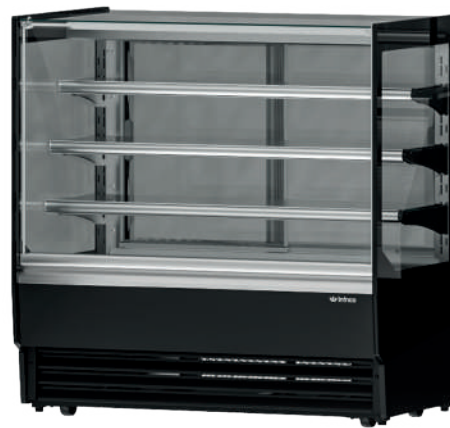
VBR 12PR STRAIGHT GLASS REFRIGERATED PASTRY DISPLAY CASE