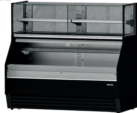
VCO 15 COMBO REFRIGERATED/NEUTRAL DISPLAY CASE