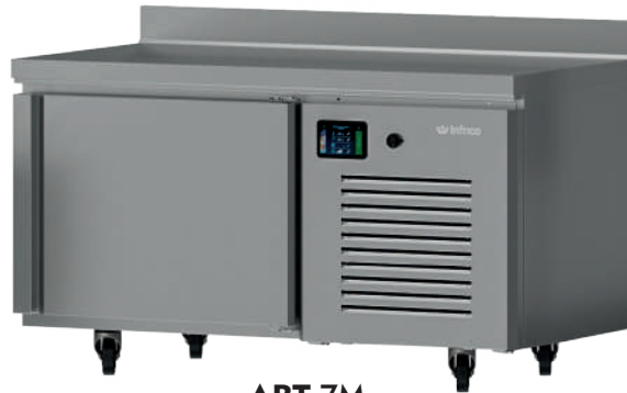
ABT 7M 7 PAN BLAST CHILLER TABLE