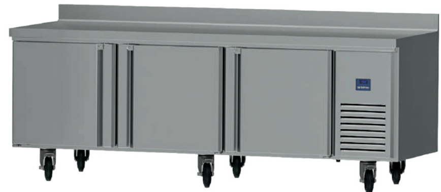
MR 93 93 INCH COUNTERTOP 3 DOORS