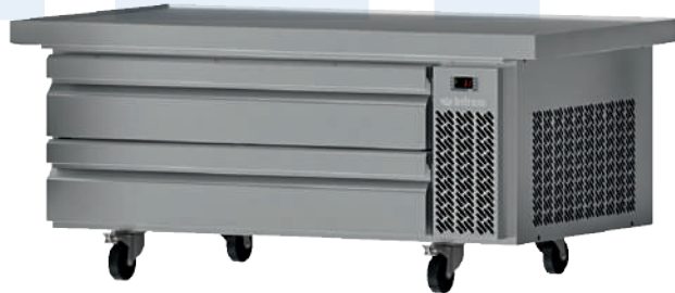
MSG 52-60 52 & 60 INCH CHEF BASE