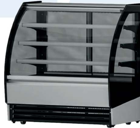
VBR 12R CURVED GLASS PASTRY DISPLAY CASE