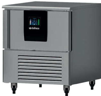
ABT 5 5 PAN BLAST CHILLER