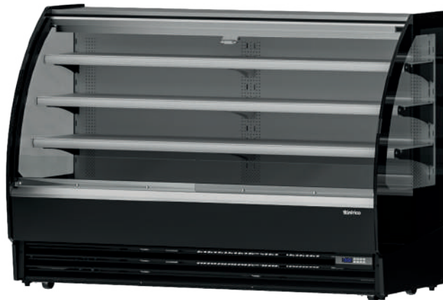
VBR 18 SS OPEN SELF-SERVICE DISPLAY CASE