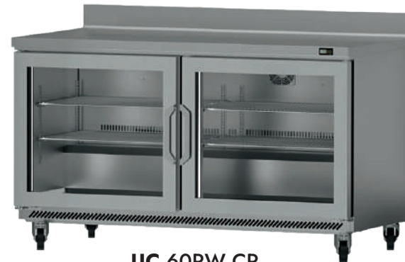
UC 60RW CR 60 INCH WORKTOP GLASS DOOR