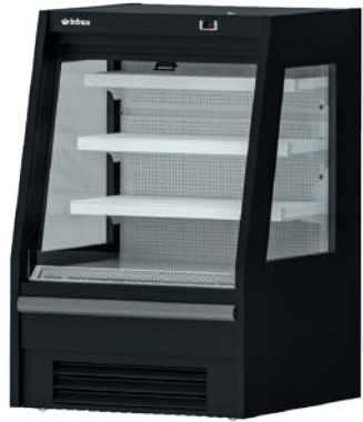
SML9 C SEMIVERTICAL OPEN MERCHANDISER COOLER

Designed to maximize product visibility and increase performance with added energy-efficient features.