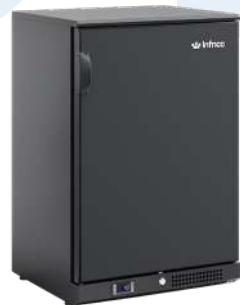
ERV 15 SD SOLID DOOR SHALLOW BACKBAR COOLER