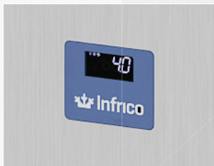
Protected digital Controller, with automatic Defrost