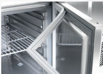
Triple chamber snap in door gasket for easy cleaning