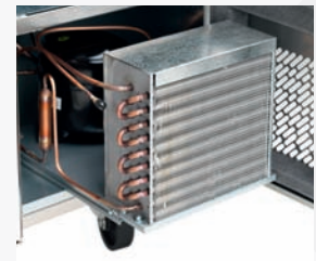
Extractable side mounted condensing unit for easy service