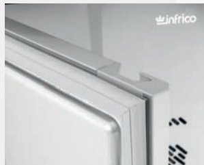
Self-closing doors with stay open feature