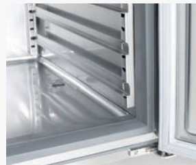
Rounded corners & sealed interior floor, NSF7, including drain plug for cleaning