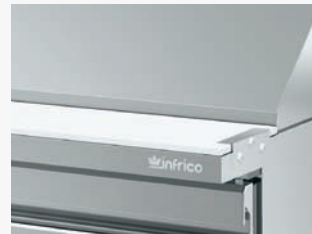
Cutting board 9-1/2" depth