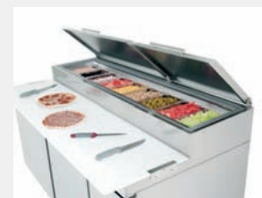
18" Work depth.