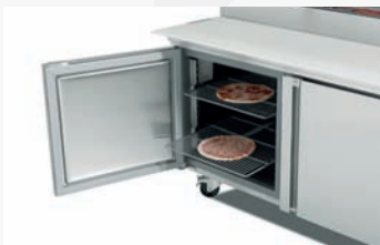
Removable shelf. Universal slides