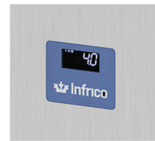
Protected digital Controller, with automatic Defrost