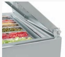
Two opening position, hinge reinforced.